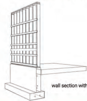
wall section with footing detail